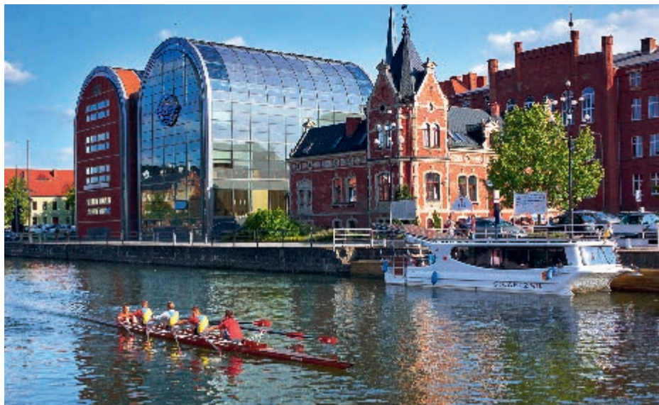
Bydgoszcz panorama from the Brda River – modern glass granaries and the Lloyd Palace