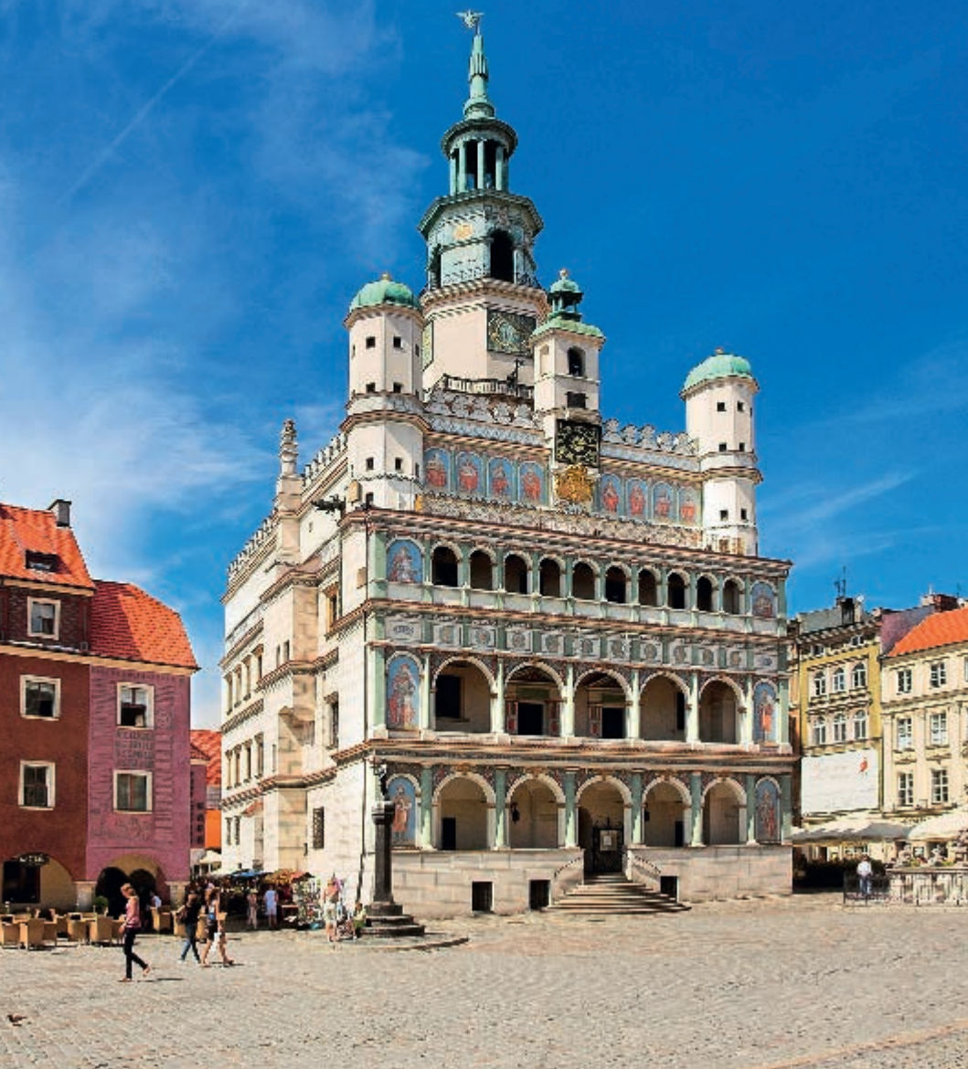
Renaissance Town Hall on Poznań Old Market Square