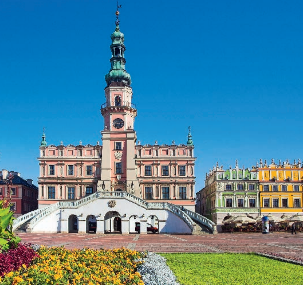
Great Market Square in Zamość – a view of the northern frontage with the town hall and townhouses with arcades