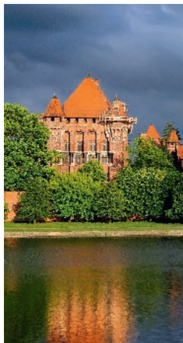
Mediaeval Malbork Castle